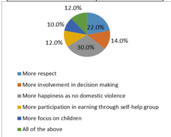
Fig. 2 A simple pie chart showing the percentage of respondents with the most positive change to women's life after alcohol ban